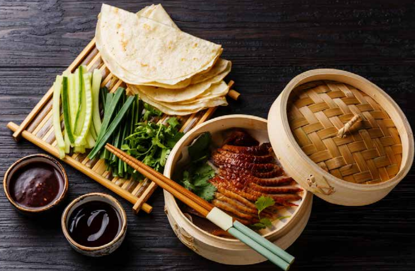
Peking Duck in bamboo steamer served with Fresh Cucumber, Scallions, Coriander and Chinese Pancakes with Hoisin sauce