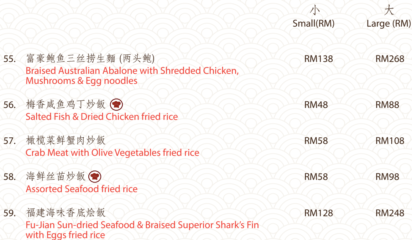
海鲜丝苗炒飯 Assorted Seafood fried rice